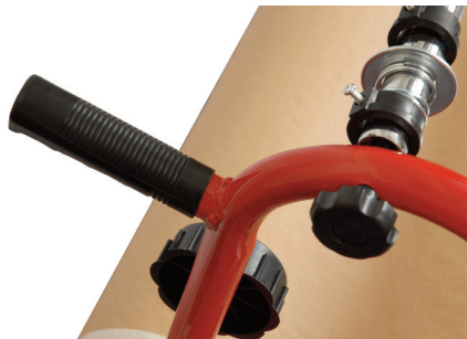
Assembly Detail 2