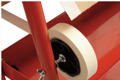
Assembly Detail 1